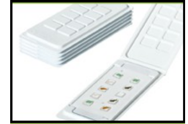
Example of PatchTransport ® Supplied by amsl allergy, australasian medical & scientific ltd

The patches are mailed in a special patch transport container, which are air tight and maintains the condition of the allergens.